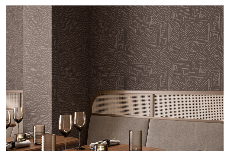
Render Ready Tiles available