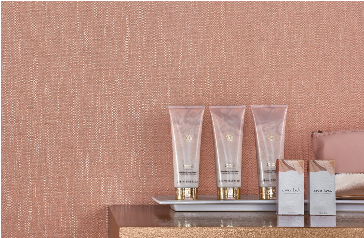
Rondelle Rose BB-BD-15